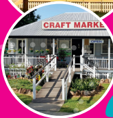
KILCOY CRAFT MARKET