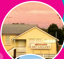
KILCOY COURTHOUSE ART GALLERY