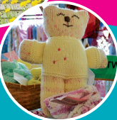
FOLK ART COOPERATIVE