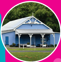
SUPPER ROOM ART GALLERY